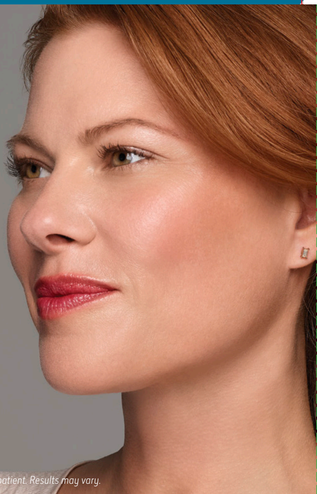
Real patient. Results may vary.

Please see additional Important Safety Information throughout.