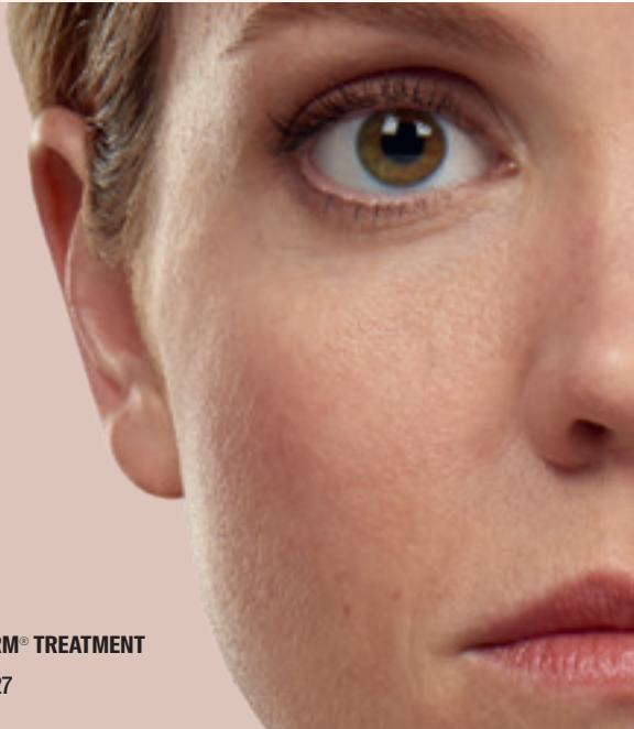
BEFORE JUVÉDERM® TREATMENT DAUGHTER, AGE 27

You and your aesthetic specialist will work together to customize your unique treatment plan. Areas of your face are interrelated and your specialist may recommend treatment in one area before treating other areas.