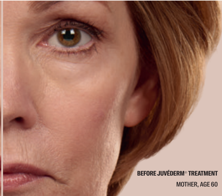
BEFORE JUVÉDERM® TREATMENT MOTHER, AGE 60